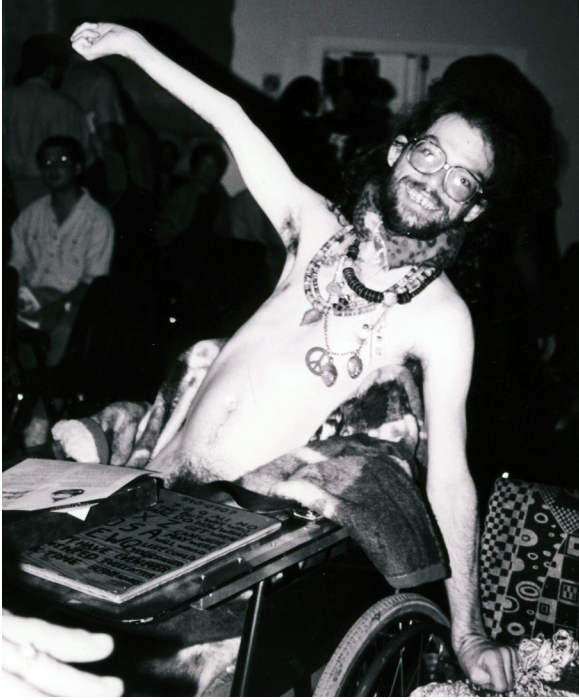
▲ Poetry Bash, Fort Mason, San Francisco 1988.

the cultural expectation would have sucked them and me into it. It fought them at every new possibility they opened to me. Their passionate commitment to how they thought things should be attracted people to me who kept opening new possibilities for me. Of course, these were in the minority. But I focused on them, making them how people should be, how I wanted to be. So I expected people and myself to be like that. So people were for the most part that way...at least